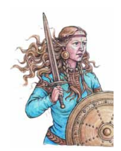
Gwenllian: the Welsh Warrior Princess