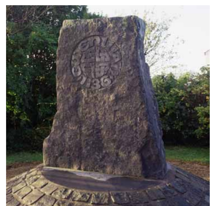
A memorial dedicated to Gwenllian at Kidwelly Castle

Gwenllian and Maelgwn were captured. Maurice de Londres showed no mercy – to set an example to all Welsh princes, he had Gwenllian beheaded for treason. It is said that a spring welled up where the brave Princess Gwenllian died – a place now known as Maes Gwenllian (Field of Gwenllian).