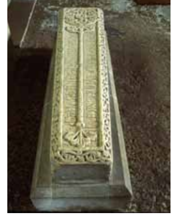
The tombstone of Maurice de Londres at Ewenny Priory