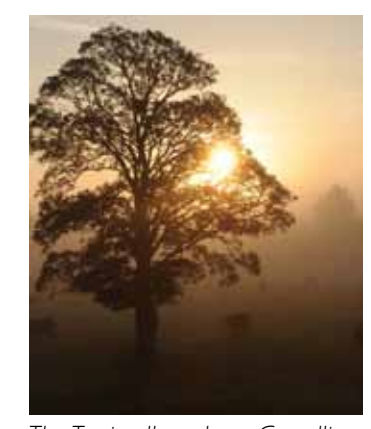
The Tywi valley where Gwenllian fled.