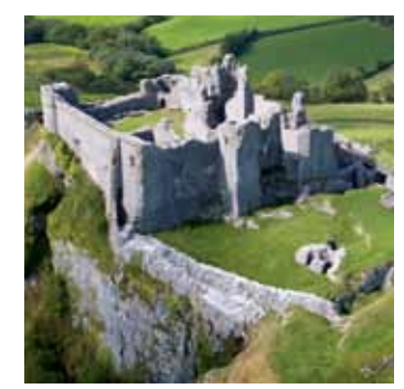
Carreg Cennen Castle